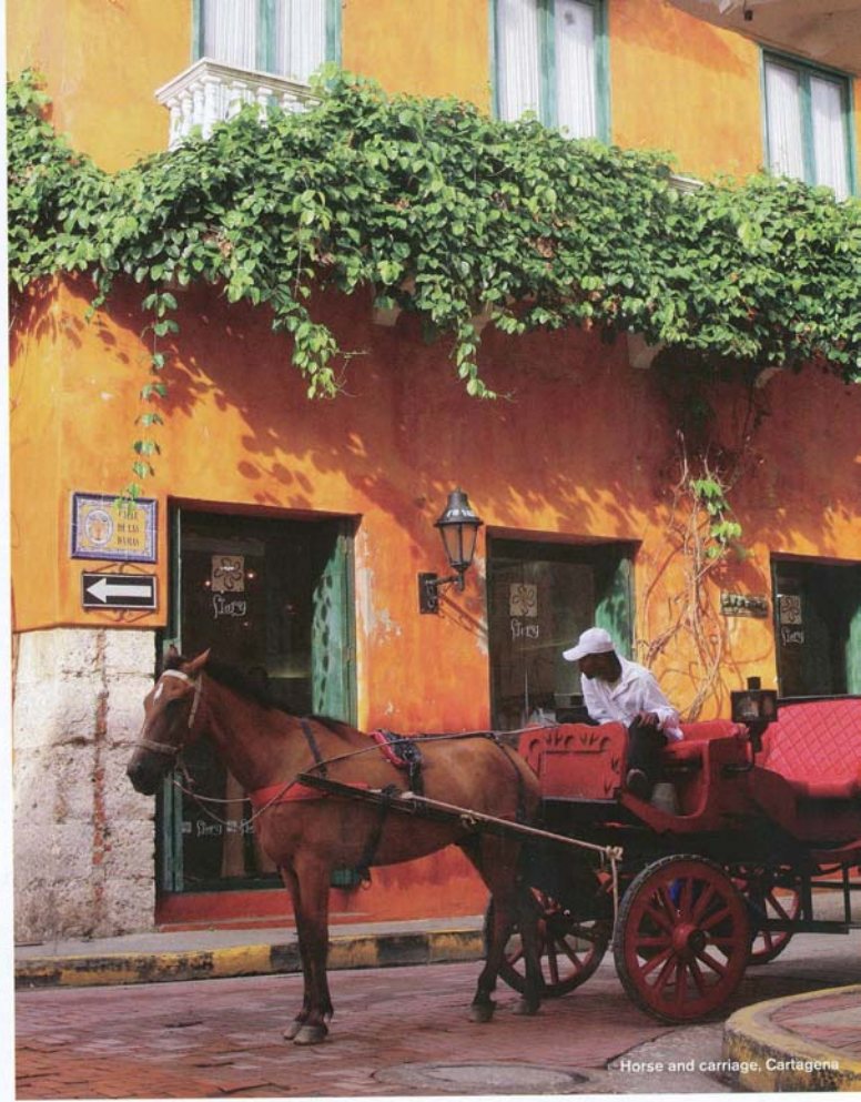
Horse and carriage, Cartagena

500 monolithic statues and tombs have been discovered. Most are enshrined within the Parque Arqueológico de San Agustín, a UNESCO World Heritage Site covering 250 square miles. Amazingly, archaeologists know nothing about the culture that made them.