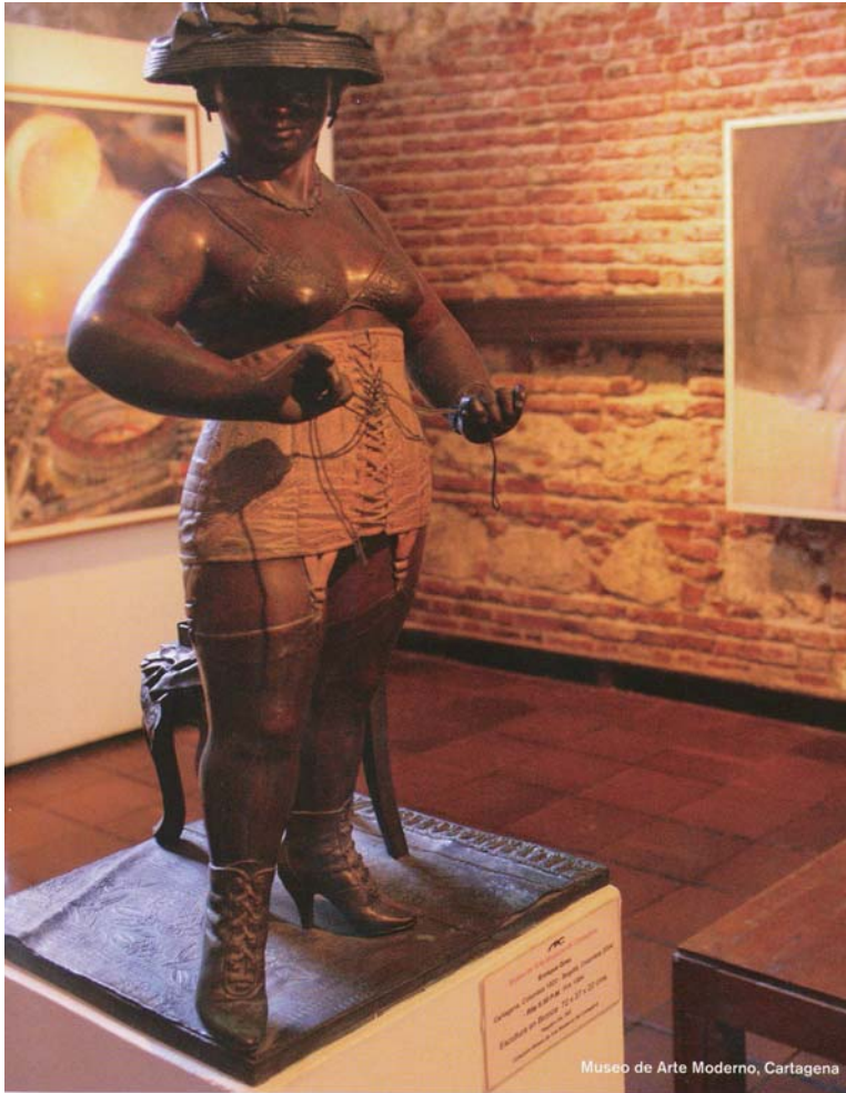
Museo de Arte Moderno, Cartagena