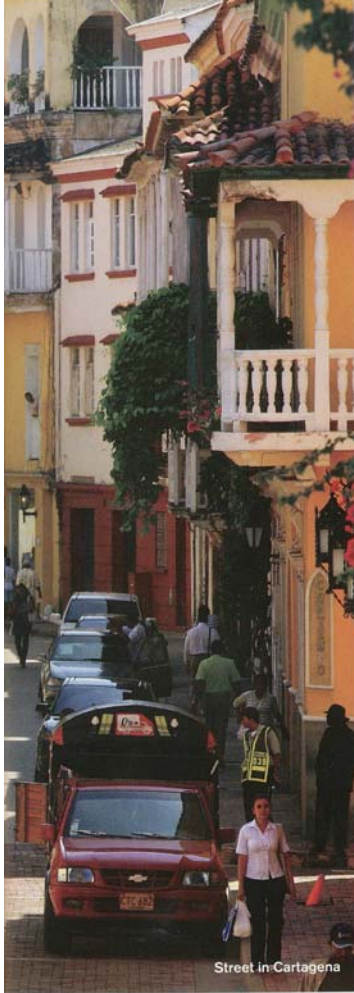
Street in Cartagena